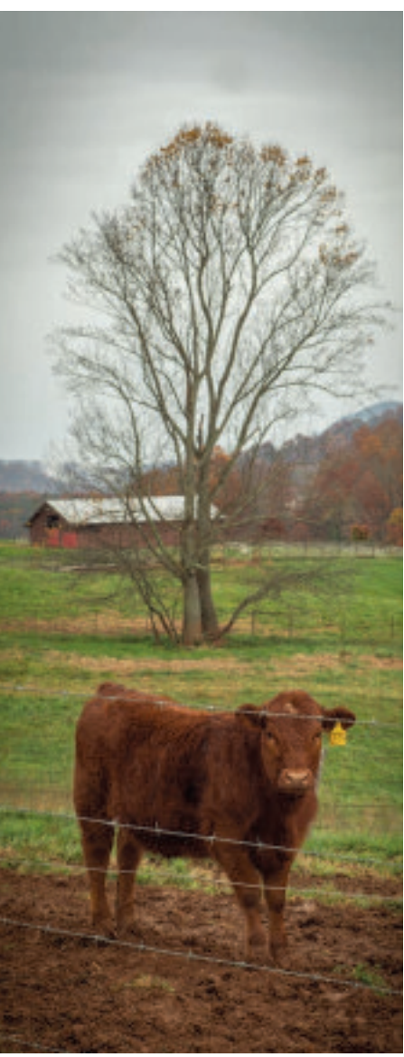
Clockwise from top, Photo 1: Sunburst Beef cattle in the field near Waynesville; Photo 2: Sunburst Beef female with Hyatt Barn in background; Photo 3: Black Angus at Charles Shook Farms, Big Sandy Mush; Photo 4: Charles Shook caring for new calf; Photo 5: Three generations of the Hyatt Family at Sunburst Beef including newly born twins